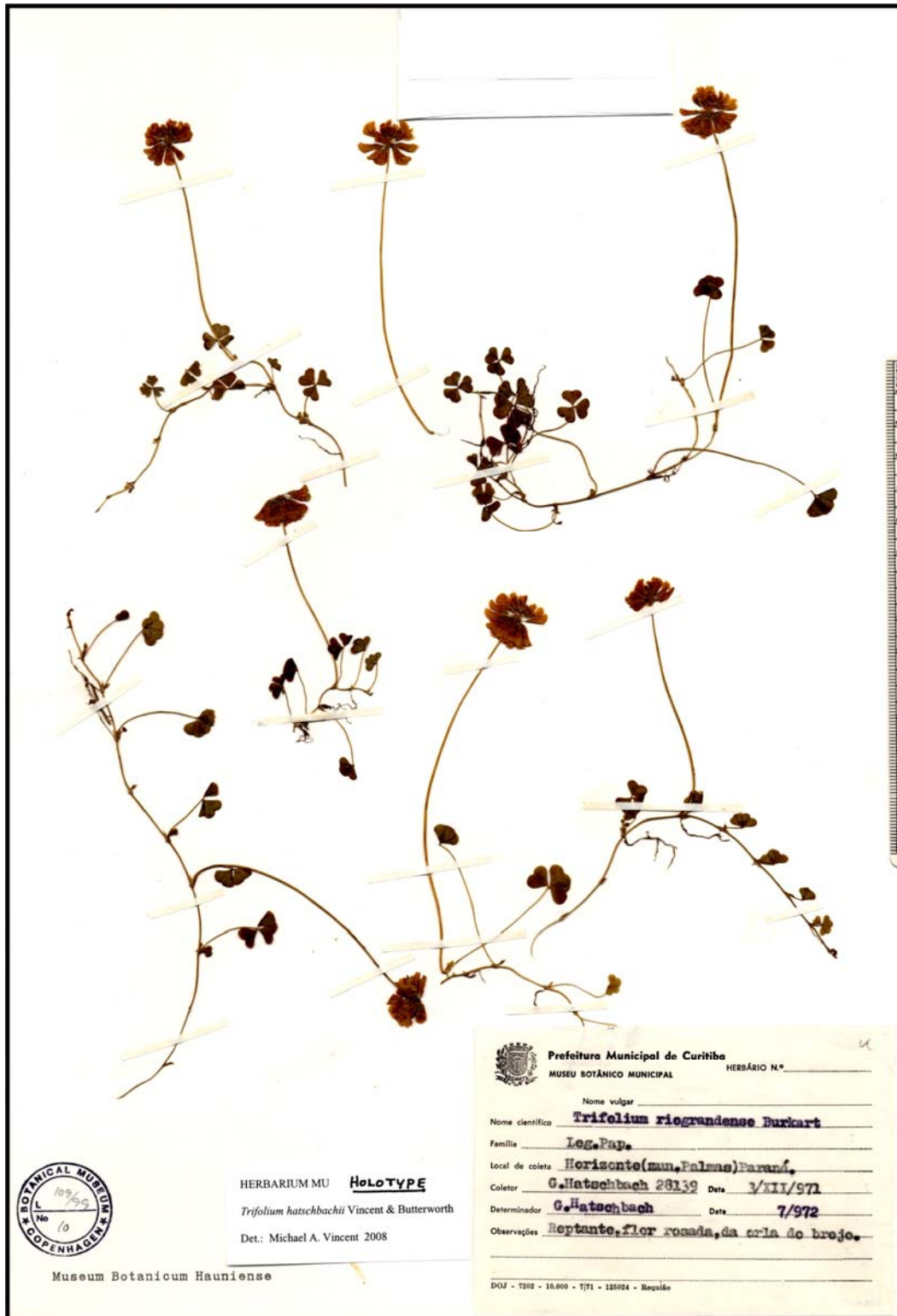
Figure 1. Holotype of Trifolium hatschbachii , Hatschbach 28139 (C).