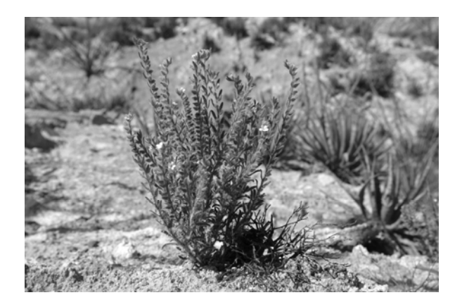
Fig. 1. Cryptantha geohintonii, growing in the field.