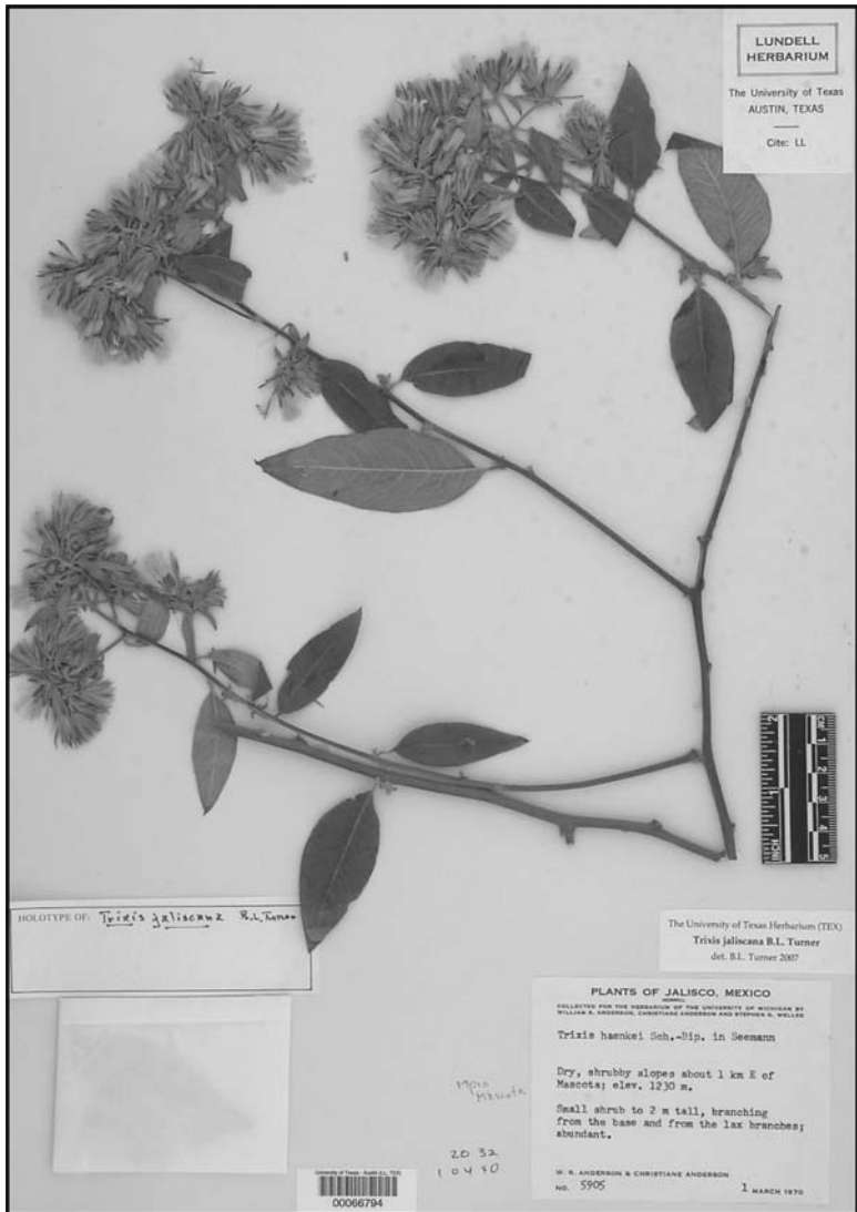
Fig. 1. Holotype of Trixis jaliscana .