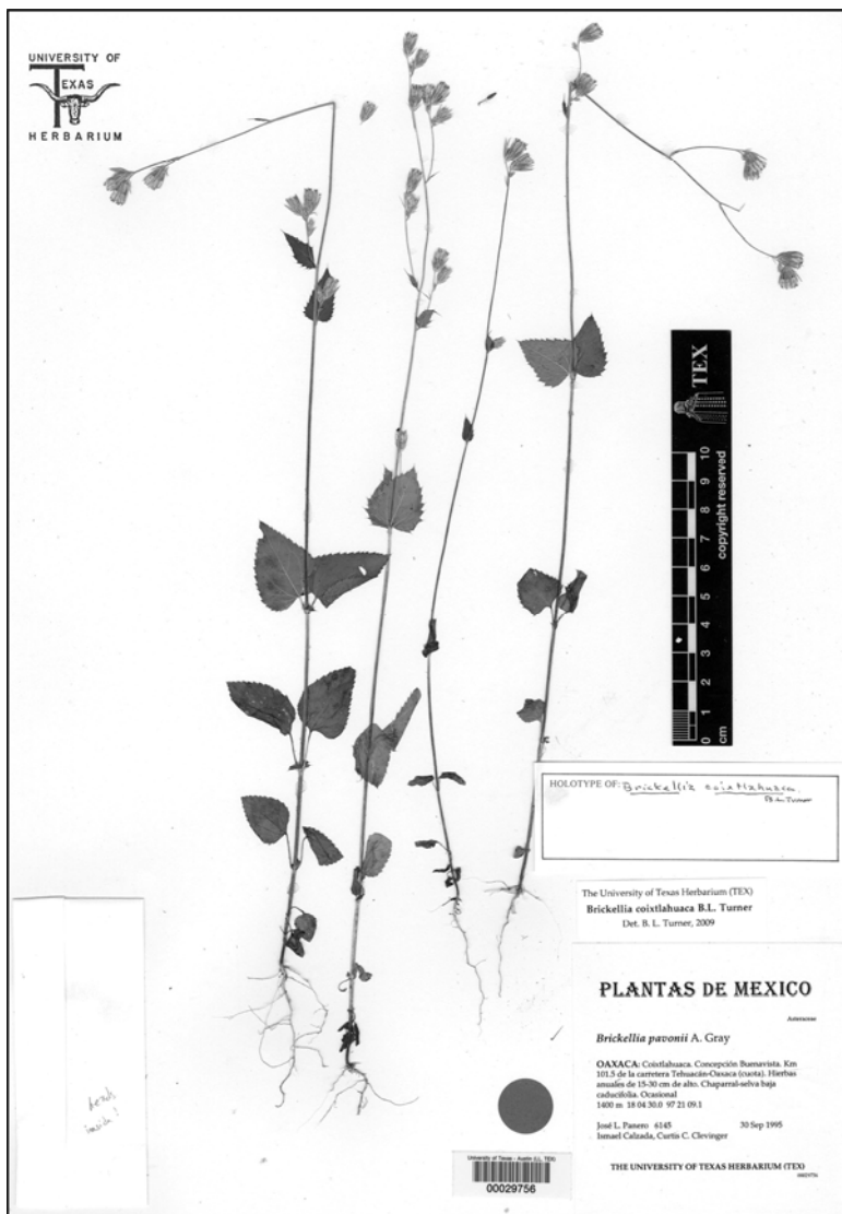
Fig. 2. Brickellia coixtlahuaca (Holotype).