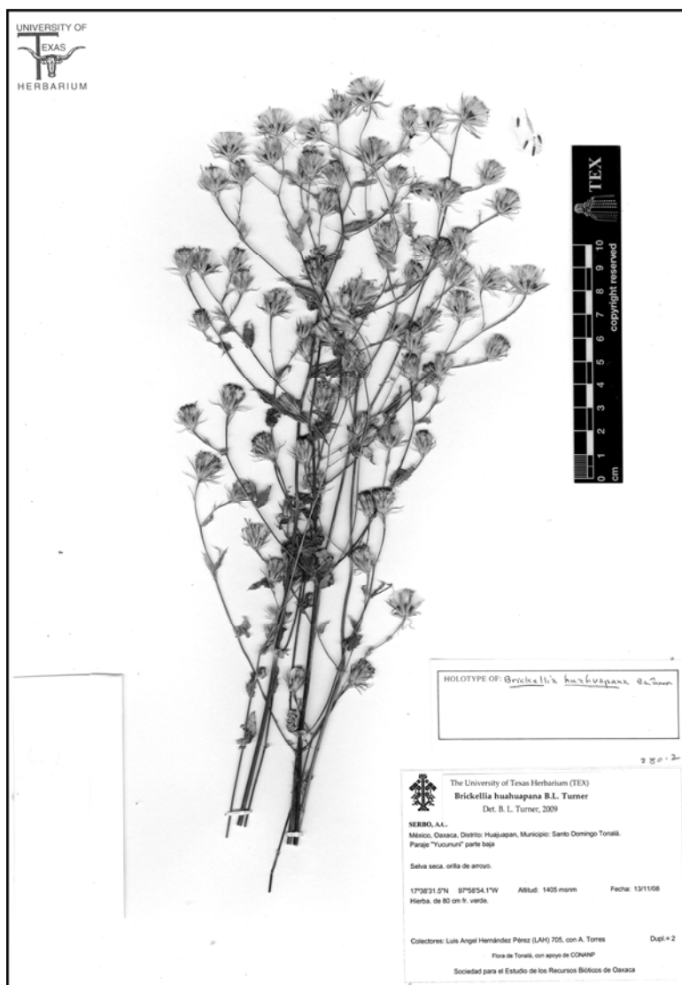
Fig. 3. Brickellia huahuapana (Holotype).