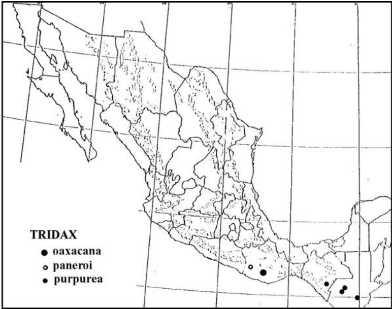
Fig. 2. Distribution of Tridax paneroi and cohorts.