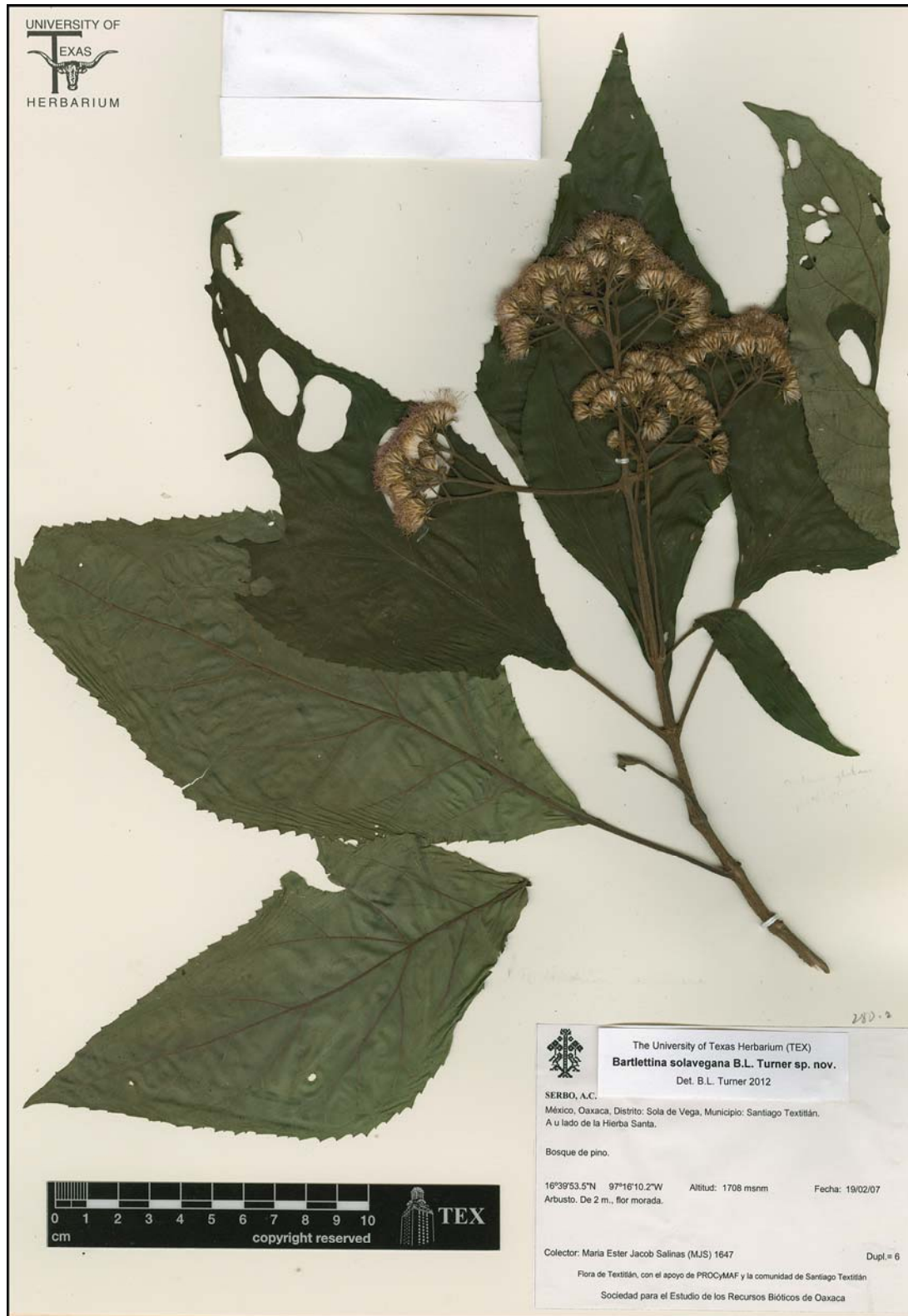
Figure 1. Bartlettina solavegana (Holotype).