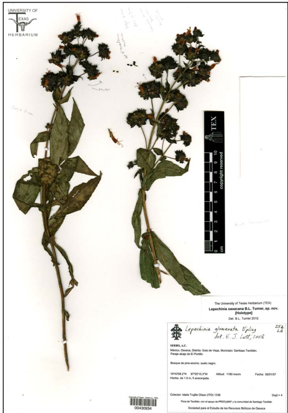
Fig. 1. Lepechinia oaxacana (Holotype: TEX).