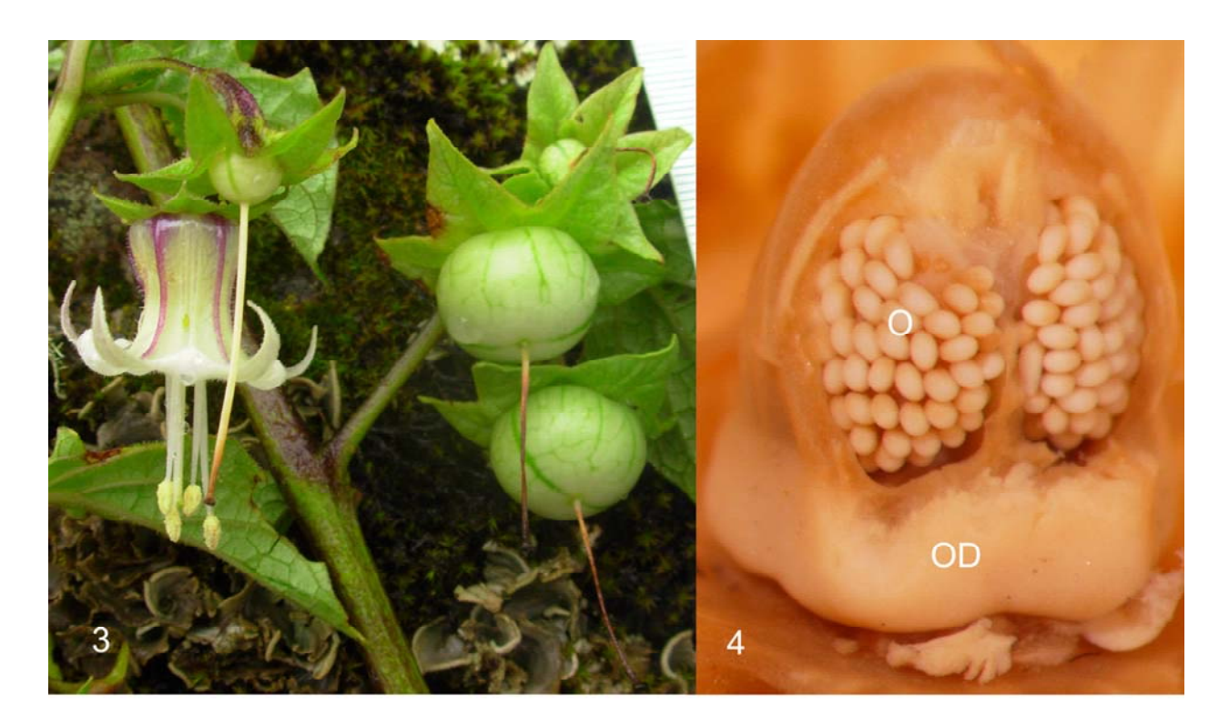
Figure 3. The corolla in this population differs from that of the type by having purple longitudinal veins, as seen in the flower on the left (anthers dehisced). The style and the ovary of a flower can be seen because the corolla-androecium abscised. The fruits are unripe. Mione et al. 800 ; photo by Thomas Mione.

Figure 4. Ovary of flower dissected to reveal ovules (O) and ovarian disk (OD). Ovary 3 mm high X 3 mm diameter at base including ovarian disk. Colors lost due to preservation in 70% ethanol; photo by Thomas Mione.