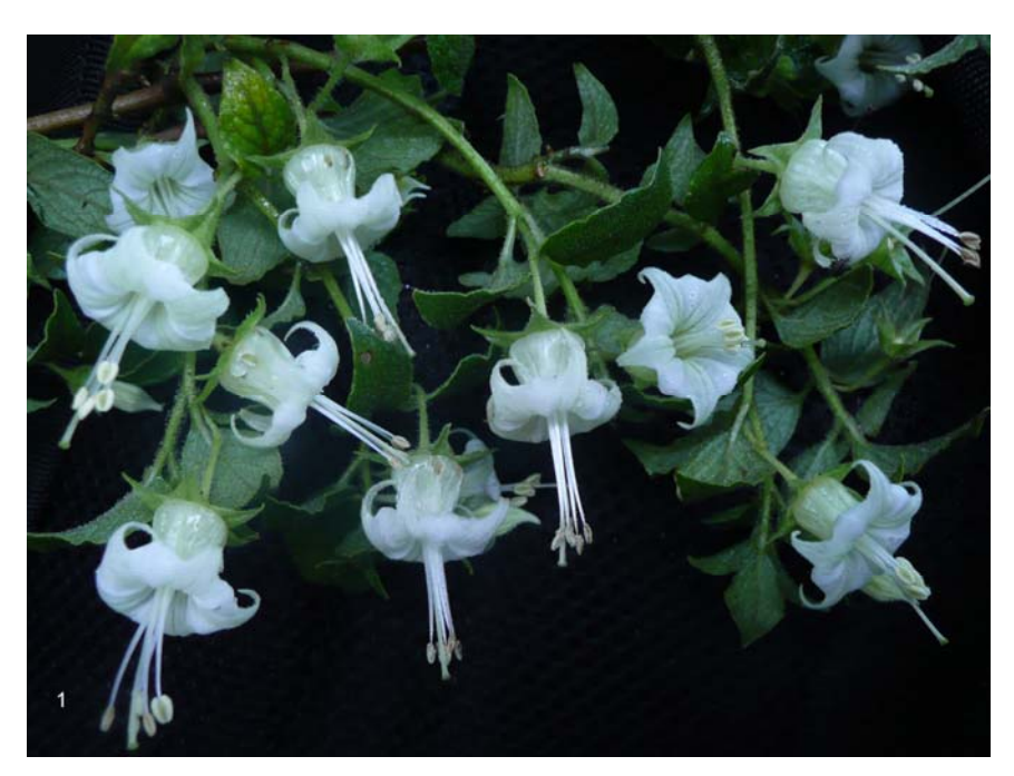
Figure 1. Flowers of Jaltomata spooneri , type collection. Note protogyny and filament elongation: the shorter stamens have undehisced anthers while longer stamens have dehisced anthers. Holes in the bases of the corollas suggest nectar robbing (floral visitors not seen). The corolla is 1.5 to 2 cm long.