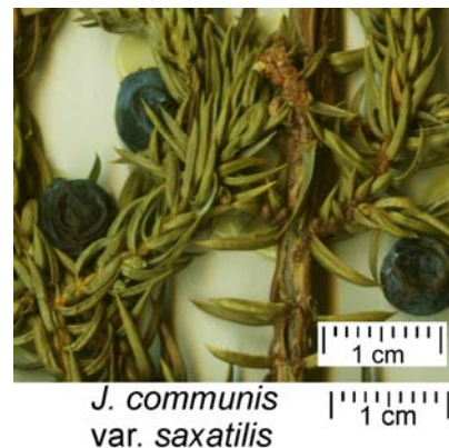
Fig. 2. Specimen of J. c. var. saxatilis from Mongolia.

The purpose of the present study was to compare the leaf volatile essential oils from J. communis , J. pygmaea and J. sibirica from Bulgaria to determine if their oils differ.