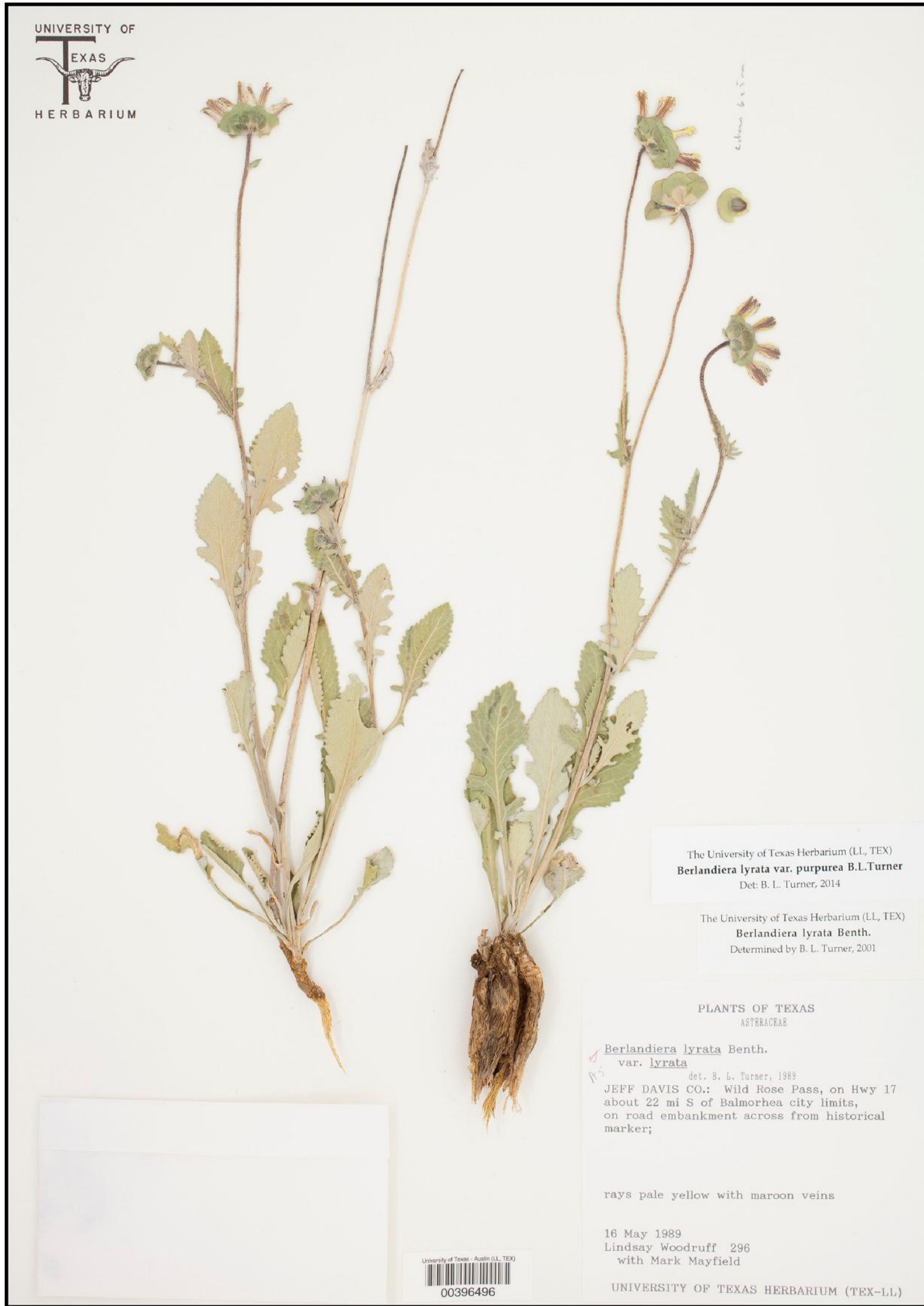
Fig. 1. Holotype of Berlandiera lyrata var. purpurea (TEX).