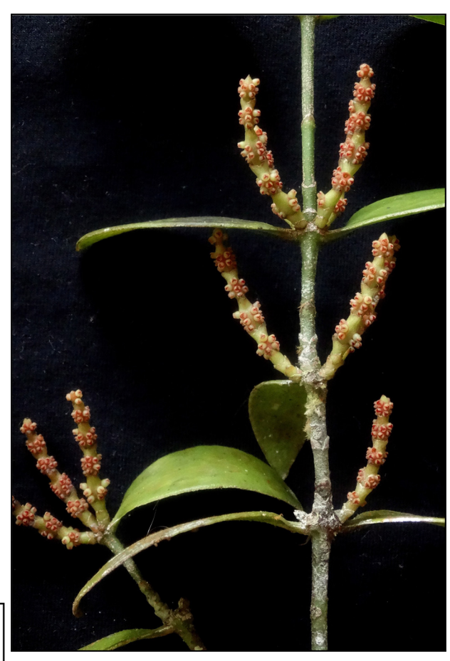
Fig. 3. Flowers and inflorescences of the type of Dendrophthora perlicarpa .