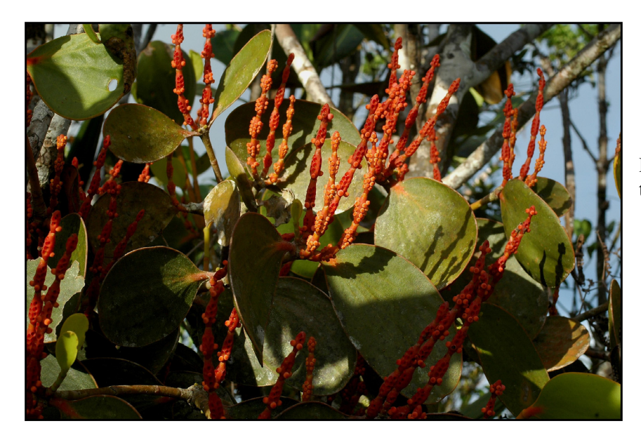
Fig. 1. General habit of the type of Dendrophthora fortis .