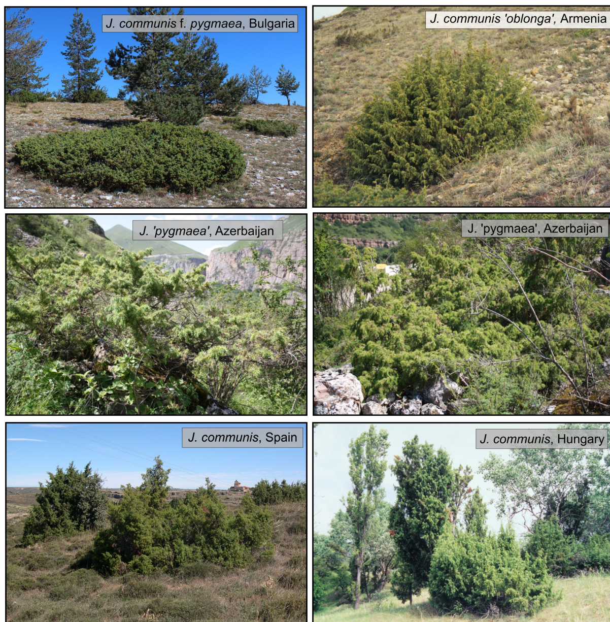
Figure 4. Plant habits of J communis f. pygmaea , Bulgaria, J. communis 'oblonga', Armenia compared to J. 'pygmaea' , Azerbaijan and J. communis , Spain and Hungary.