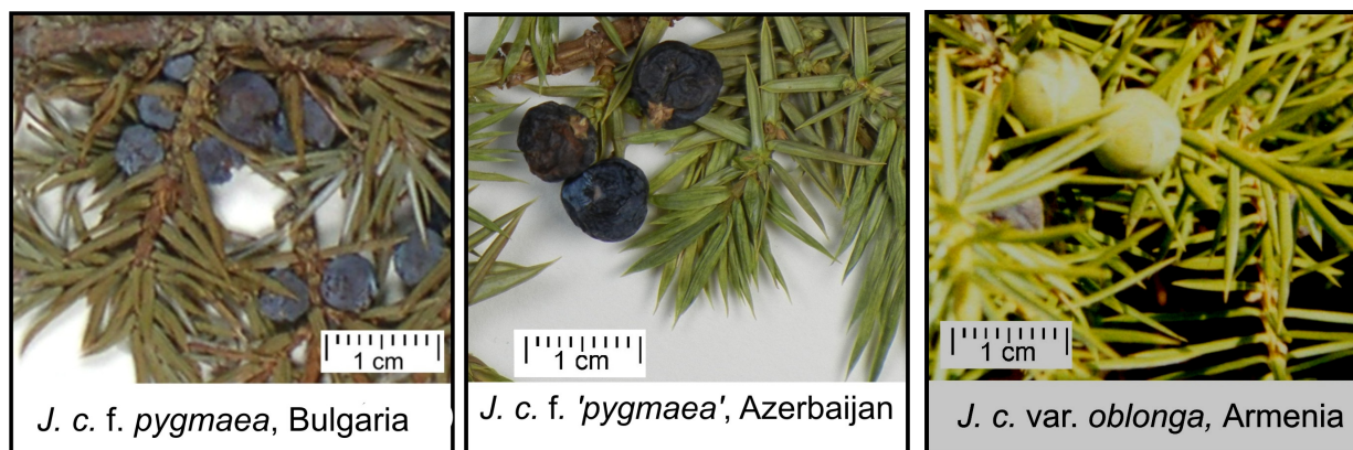
Figure 1. Leaves and seed cones of J. c. f. pygmaea , Bulgaria J. c. f. 'pygmaea' , Azerbaijan and J. c. var. oblonga , Armenia.

The purpose of this study was to compare data from nrDNA and four cpDNA regions of J. pygmaea from Azerbaijan with other members of Juniperus sect. Juniperus from the eastern hemisphere to determine the taxonomic affinity of J. 'pygmaea' from Azerbaijan.