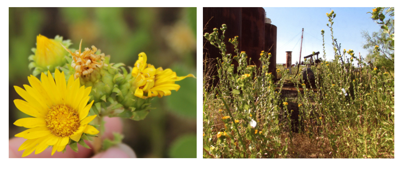
Fig. 1. Close-up of G. ciliata flower and buds. Grimes Co., TX, Photo by Nathan Taylor.

Grindelia ciliata is a large plant (up to 2 m), that grows in disturbed sites in various soils and precipitations (Figs. 1, 2). It appears to have potential as a semi-arid land bio-crude crop plant. In contrast to most Grindelia species, in G. ciliata , the leaves and buds are not gummy or with exuded resin, yet, the bio-crude yields are comparable to sticky or gummy Grindelia species. Sequestering the resin inside the leaves would seem to be an important agronomic character, as sticky leaves would be difficult to swath and bale. The purpose of the present paper is to survey non-polar (pentane) yields from individuals in natural populations of G. ciliata to evaluate its potential as a source of bio-crude.