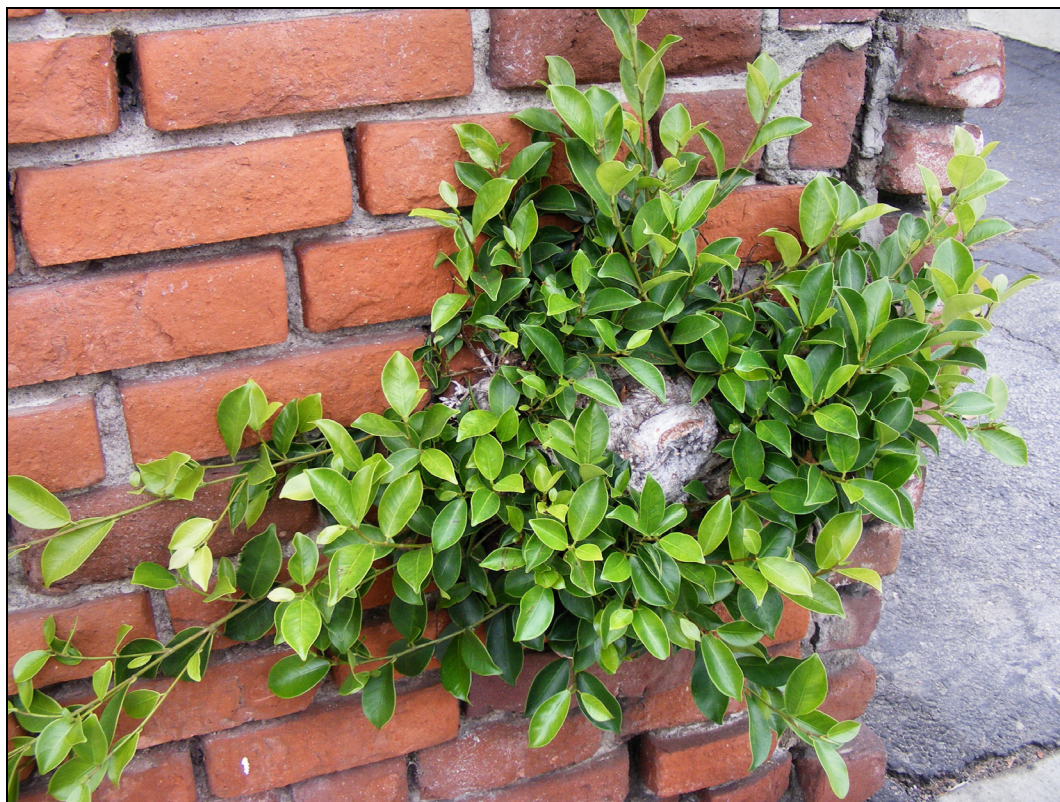
Figure 9. Ficus microcarpa grows in joints of old masonry and crumbling brick walls, Laguna Beach, Orange County. Note the base has been cut back during landscape maintenance activities.