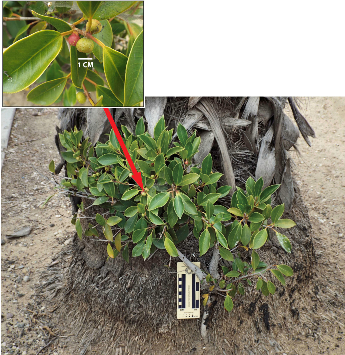
Figure 8. View of F. microcarpa growing at the base of Washingtonia robusta in Oceanside, San Diego County. This was the smallest fertile plant observed during the study.