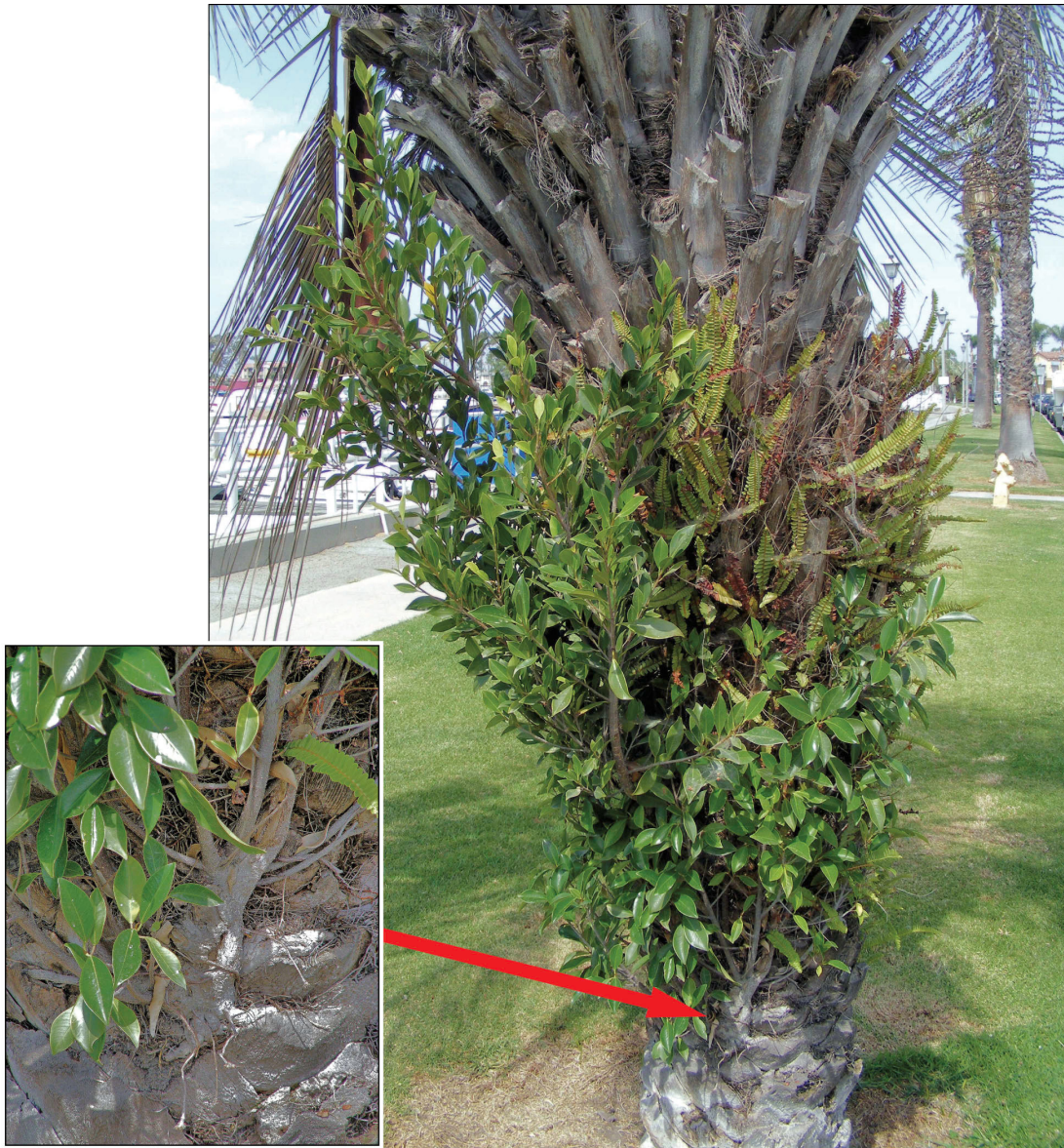
Figure 14. Ficus microcarpa , a strangler fig, is epiphytic on a palm tree trunk with Nephrolepis cordifolia in Long Beach, California. Note persistent leaf bases of Butia capitata . Inset photograph shows root basket formation typical of strangler figs that constrict and gradually kill host trees.