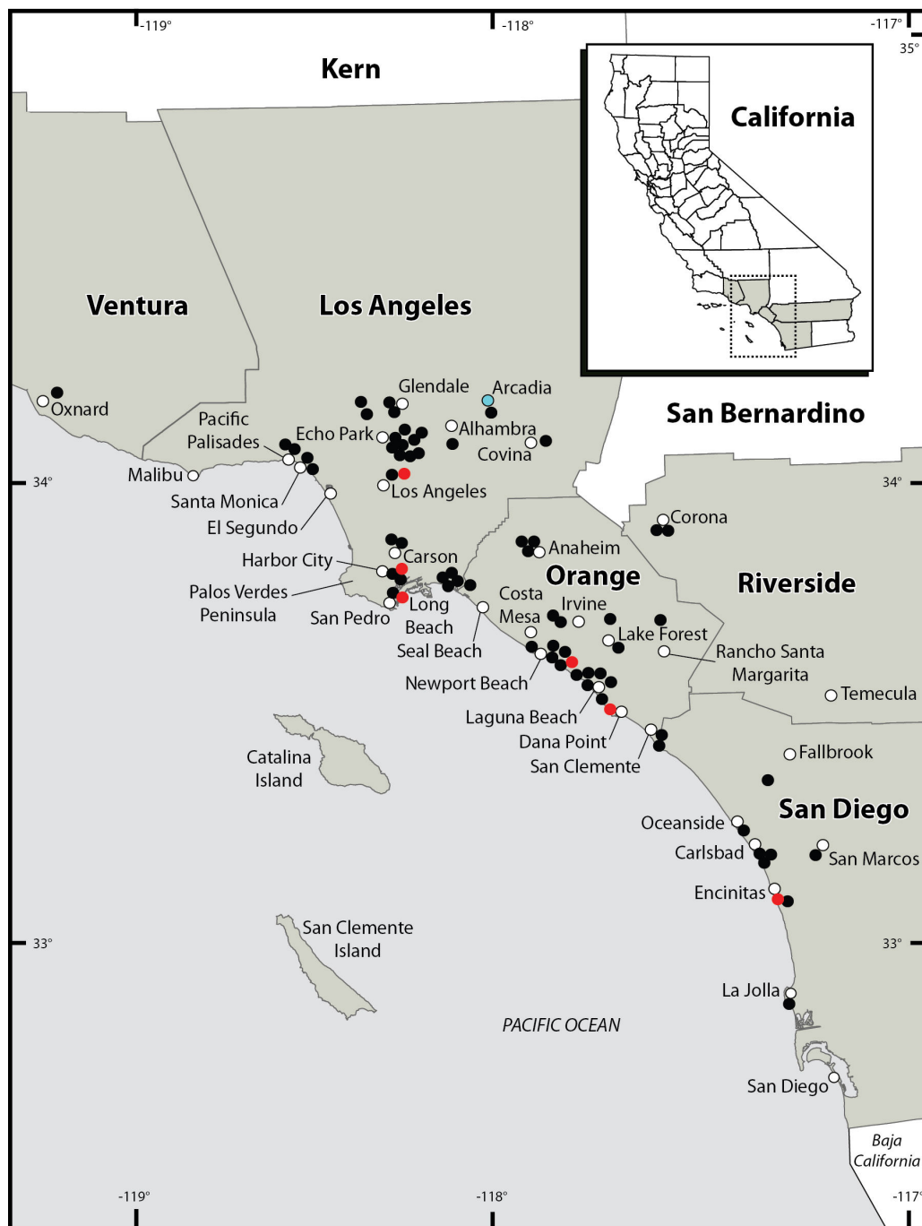
Figure 1. Known naturalized distribution of F. microcarpa in southern California: a solid circle (●) depicts locations documented in urban and native habitats; a red circle (●) identifies the largest of the naturalized trees observed during this study; and a blue circle (●) identifies the approximate location (Arcadia) of the first documented record of its pollinating fig wasp, E. verticillata , for California.