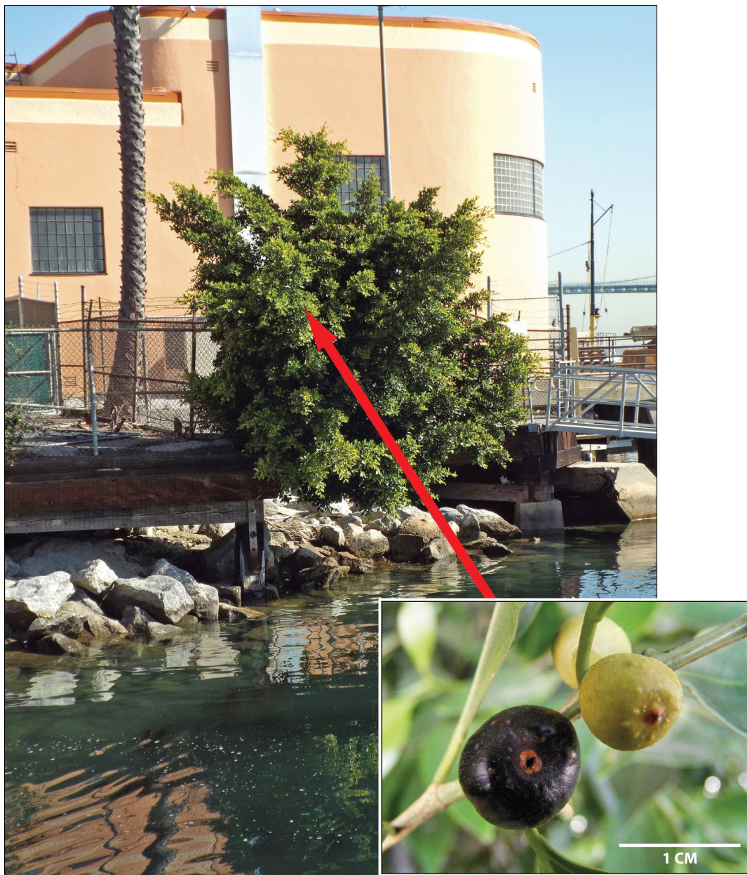
Figure 3. Approximately 3.5 m tall F. microcarpa tree growing from the side of a concrete reinforced bulkhead along harbor shores at San Pedro, Los Angeles County. Inset photograph showing mature and developing syconia. The Los Angeles Maritime Museum is in the background.