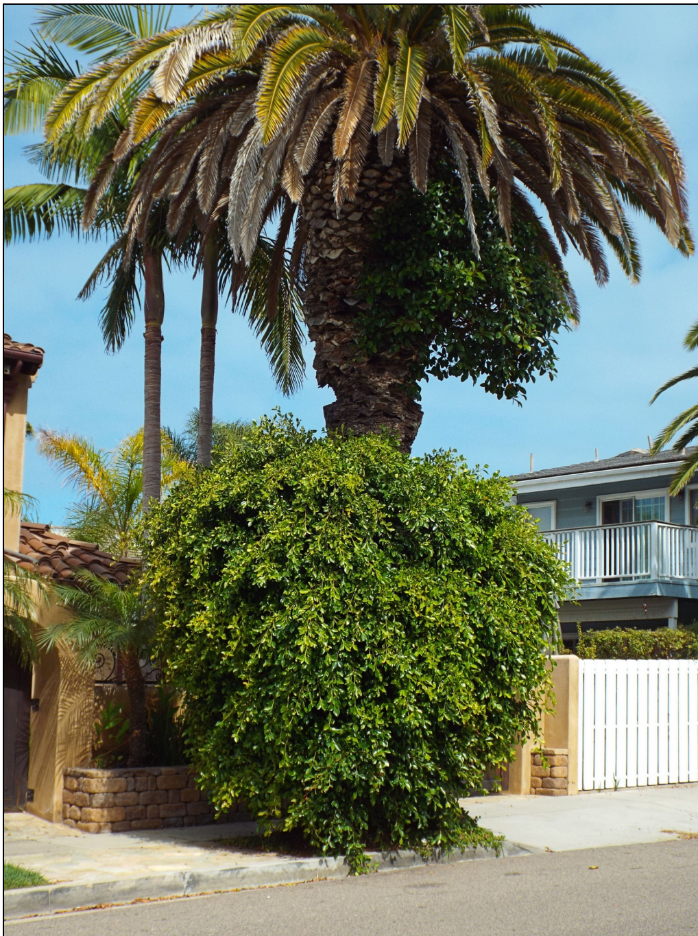
Figure 7. Ficus microcarpa growing on the trunk of P. canariensis cultivated in Encinitas, San Diego County. Note F. rubiginosa growing on the upper trunk.