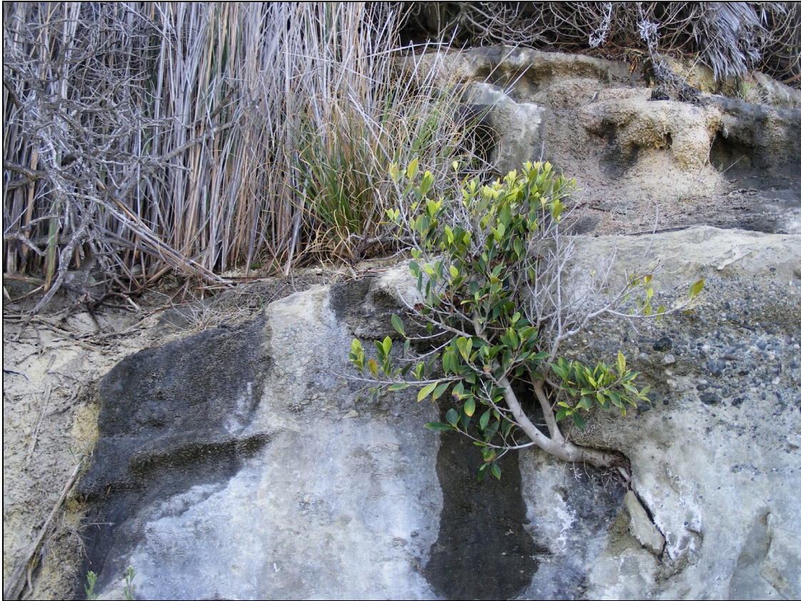
Figure 12. Ficus microcarpa occurs rarely in native plant communities along the immediate coast. This approximately 1 m tall shrub grows on a calcareous-saline outcrop in Laguna Beach, Orange County. Note ephemeral seepage and salt crust formation on the outcrop surface.