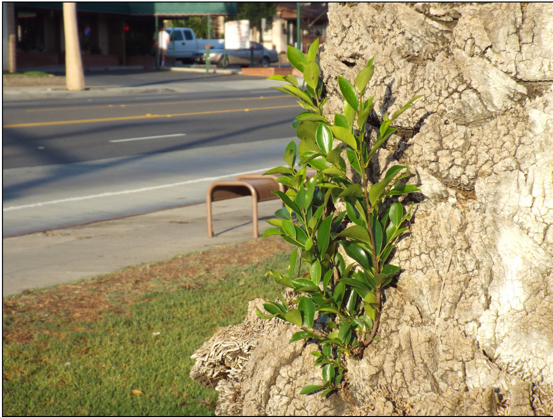
Figure 10. View of F. microcarpa juvenile plant growing on the trunk of P. canariensis , Corona City Park, western Riverside County. Plants at the inland extremes of its current range may be influenced by aerosol drift from urban irrigation spray heads.