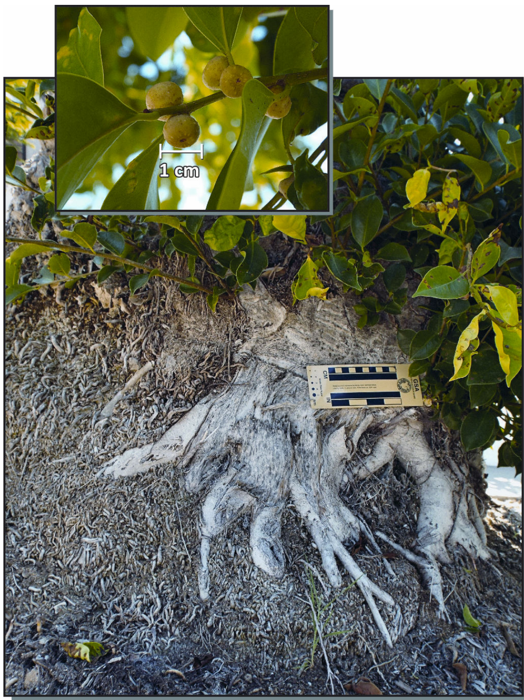
Figure 5. View of an approximately 3 m tall F. microcarpa tree growing on the base of a cultivated P. canariensis palm tree in Newport Beach, Orange County. Note the base (ca. 28 cm wide) of F. microcarpa has been cut back during landscape maintenance activities. Inset photograph showing immature syconia.