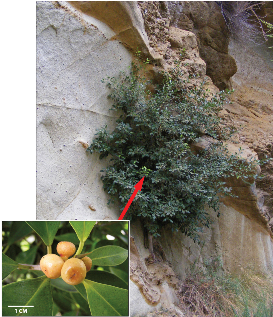
Figure 6. View of an approximately 3 m tall F. microcarpa tree growing at the base of a calcareous-saline sandstone cliff in Dana Point, Orange County. Many Ficus species that are hemi-epiphytes are also lithophytes, thereby enabling colonization of many urban and native habitats in southern California. Inset photograph shows immature syconia.