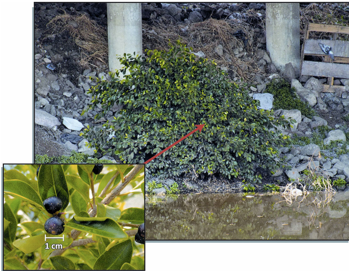
Figure 11. Ficus microcarpa grows in calcareous-saline soils on the bank of a tidal urban channel, Dominguez Channel, Carson, Los Angeles County. Perennial forbs in the photograph are Parietaria judaica L. (Urticaceae), another urban weed occasionally found in coastal native habitats.