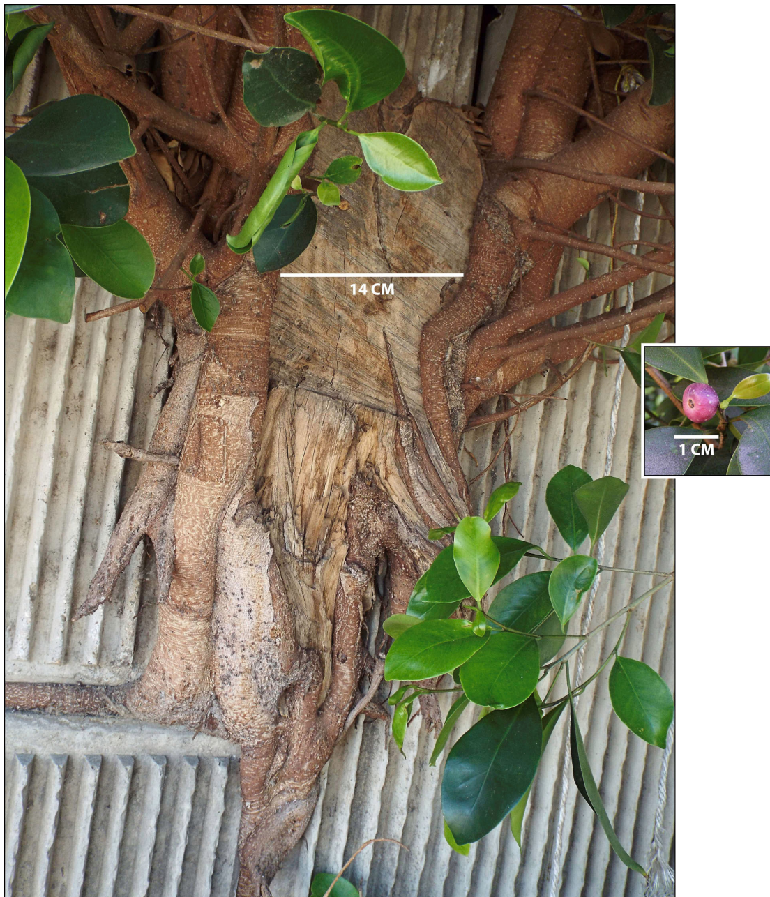
Figure 2. View of an approximately 5 m tall F. microcarpa tree growing on rough-grouted concrete wall at Harbor City, Los Angeles County. Note aerial and adventitious roots and tree base that has been cut back during landscape maintenance activities. Inset photograph showing mature syconium.