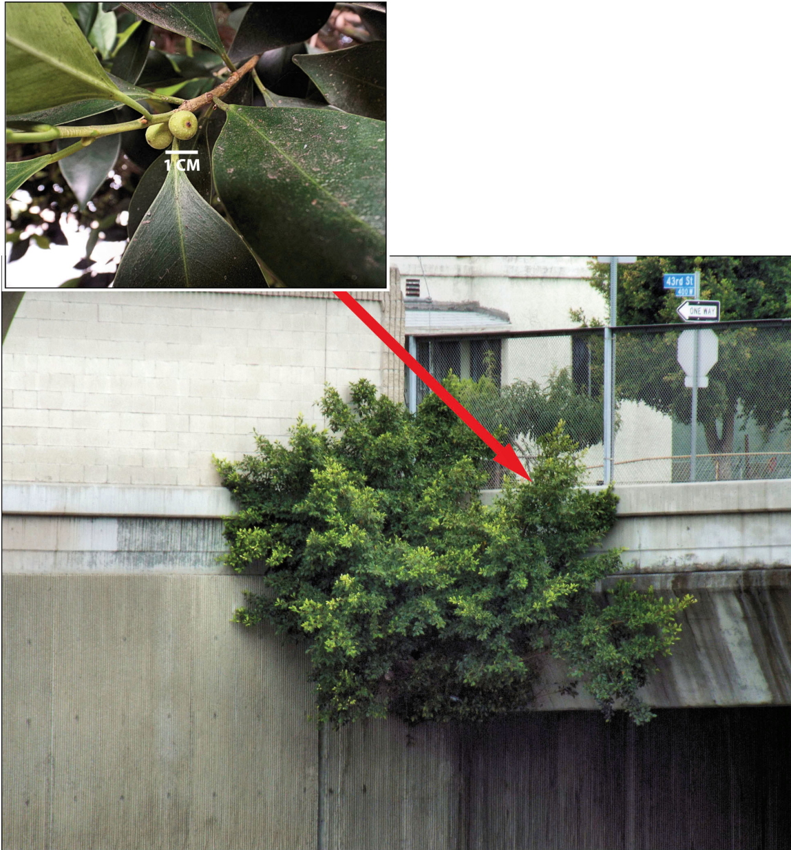
Figure 4. View of an approximately 3.2 m tall F. microcarpa tree rooted in an expansion joint of the 43 rd Street bridge on the 110 Freeway, City of Los Angeles. Note water stains on bridge and retaining wall from urban runoff, and cultivated F. microcarpa tree planted along Flower St. the in upper right-hand side of photograph. Inset photograph showing immature syconia.