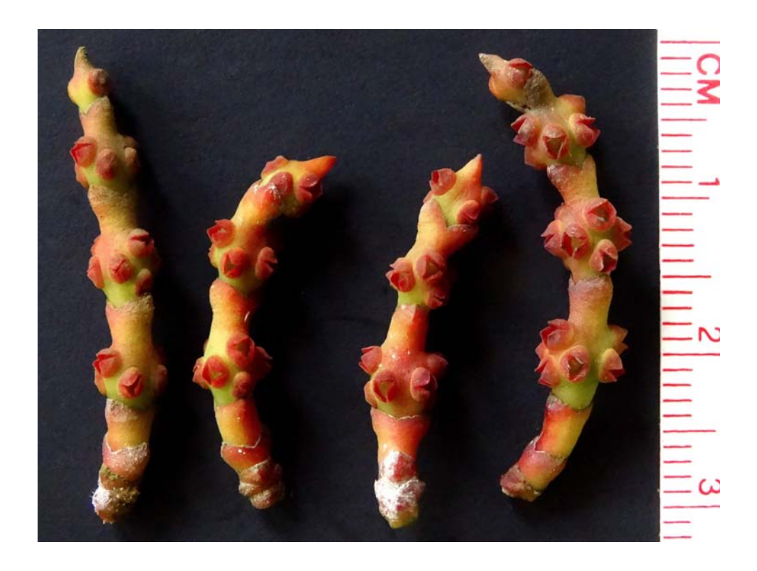
Fig. 2. Dendrophthora primaria, female inflorescences. Harrison & Harrison 638 (UCH).