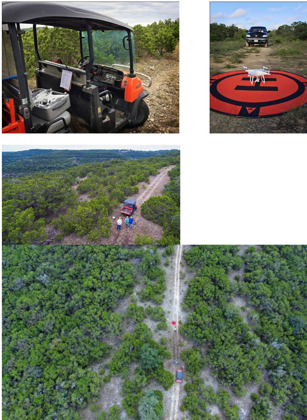
Figure 3. Photograph of the drone (DJI Phantom 4 quadcopter) in the ground transportation (ATV, top left side) and on the landing pad prior to takeoff (top right). Middle photograph shows the crew and the ATV and the photograph was taken from the drone. The bottom photograph shows the landing pad (orange circle) taken from the drone with the authors and transportation on the hilltop adjacent to the “Tin Cup Canyon”.