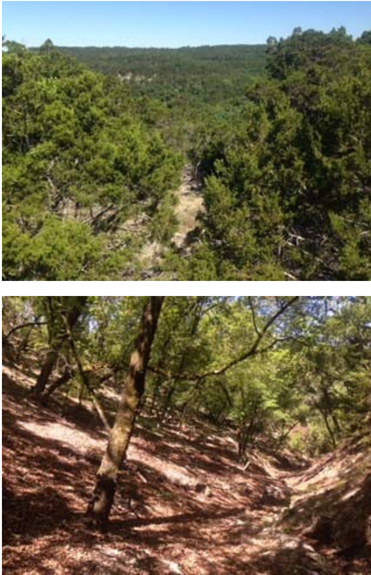
Figure 2. Photograph (upper) shows an overview of “Tin Cup Canyon” and the understory (lower) of several Acer grandidentatum trees in one of the community’s surveyed. Note few or no understory juvenile woody plants.