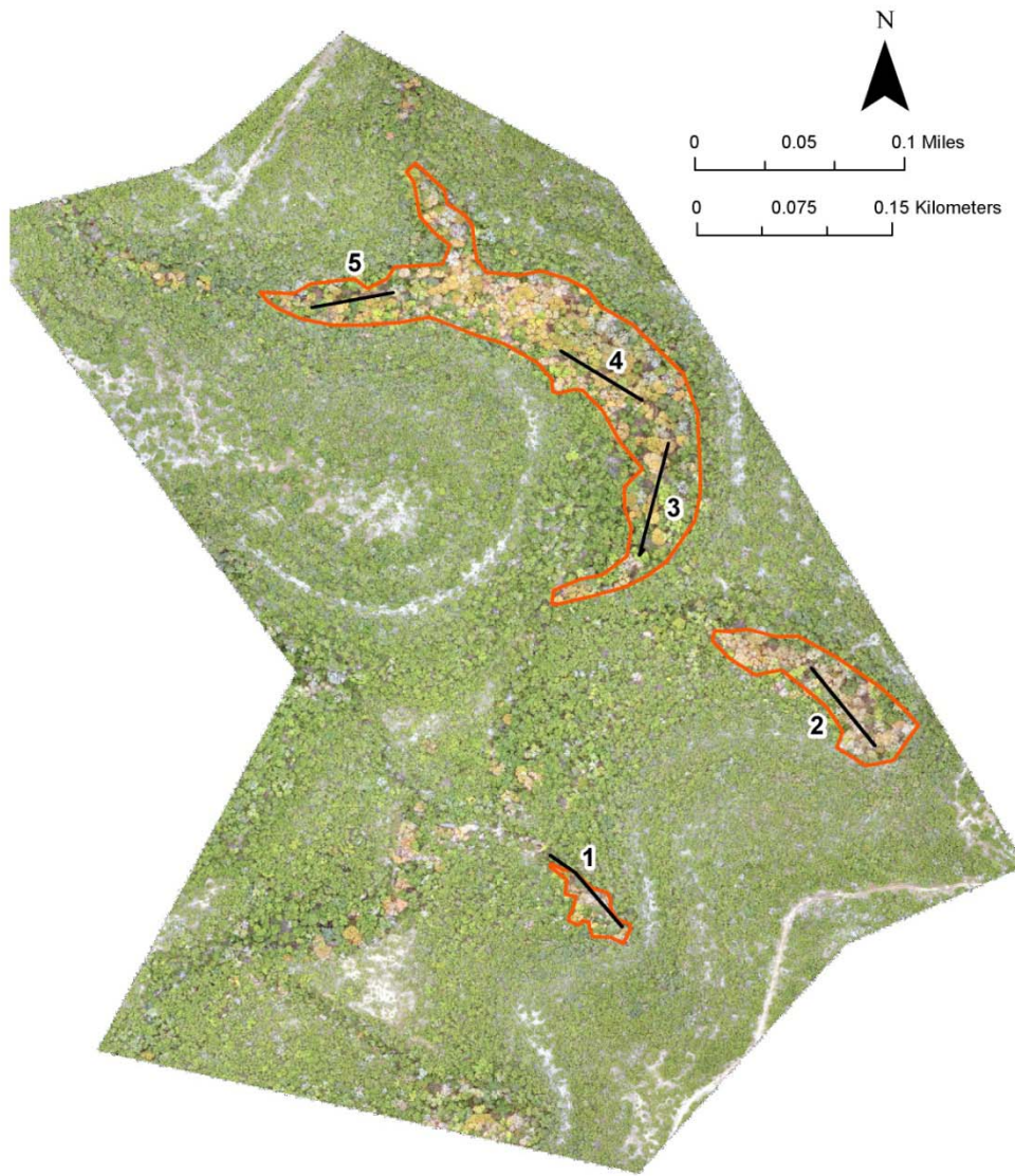
Figure 6. Study area from the drone at approximately 96.3 m (316 ft. AGL). Deciduous communities are outlined in orange with each transect in black and numbered.