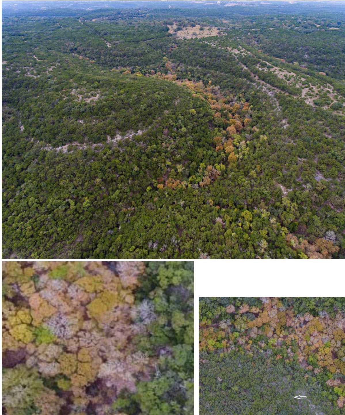
Figure 4. Oblique aerial view (upper photograph) of the study area, mostly “Tin Cup Canyon”. Photograph was taken from the drone at an altitude of approximately 100 m on November 15, 2016 showing fall colors of the deciduous community in the canyon. The lower photograph is a close up view of the edge of the trees in the deciduous woodland. The arrow points out a Juniperus ashei tree.