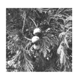
J. f. var. flaccida J. f. var. martinezii J. f. var. poblana Figure 1. Comparison of leaf foliage among J. f. var. flaccida, J. f. var. martinezii and J. f. var. poblana.