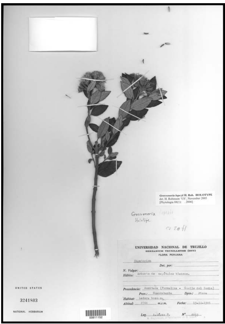
Fig. 1. Grosvenoria lopezii H. Robinson, holotype, United States National Herbarium (US).

Grosvenoria lopezii H. Rob., sp. nov. Type: Peru. Piura: Huancabamba, Rumitana (Turmalina – Cuello del Indio), 2700 m, ladera boscosa, arbusto de capítulos blancos, 13 Sep 1981, A. López M., A. Sagástegui, J. Mostacero & S. López 8853 (holotype US, isotypes F, HUT). (Fig. 1).