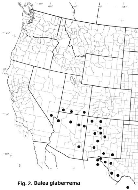
Fig. 2. Dalea glaberrema